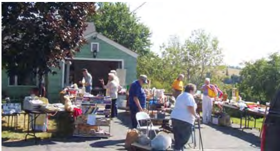
Our Fall Yard Sale & Adoption Fair