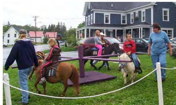
Our free pony rides for children