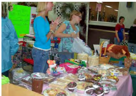
Caribou Arts & Crafts Fair – our bake table