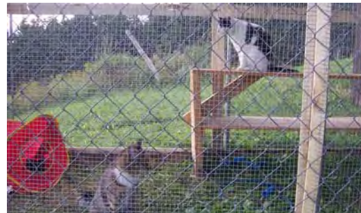
Our outside exercise pens for our cats